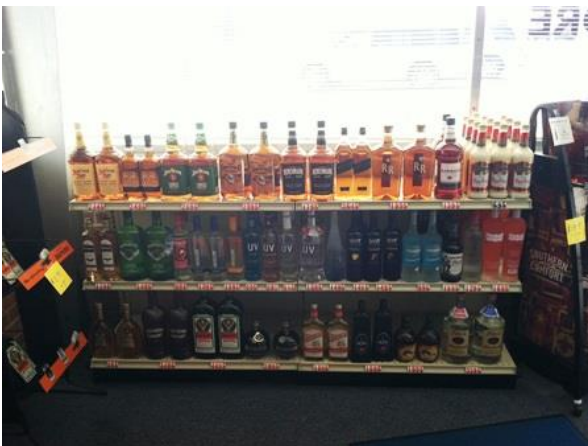
Shelf within the store