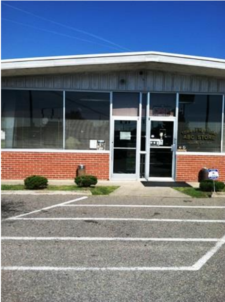
Exterior view of the store